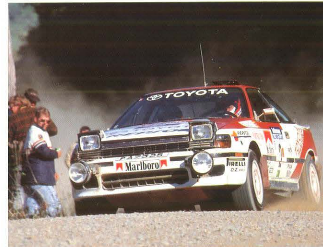
Rallye World Champion 1990 Carlos Sainz driving Toyota Celica Turbo 4 WD with Bilstein.