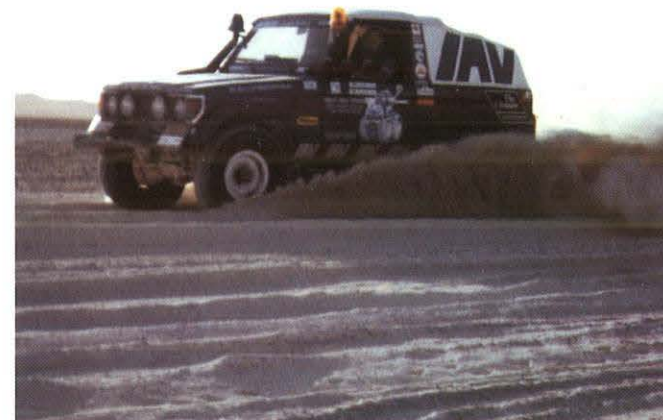
Landcruiser with Bilstein, also successful in desert rallies.